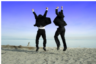
A joyous leap for joyous things! - RWI