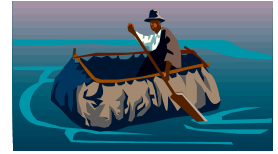
Tibet-related ClipArt! - RWI