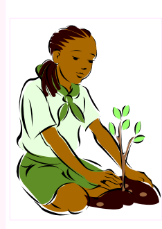
The future needs nurturing!