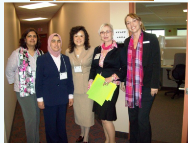
Host Workers at Culture-Link's AGM 2010